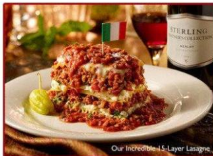
Our Incredible 15-Layer Lasagne

36 West 5th Street Dayton, OH 45402 (937) 461-3913